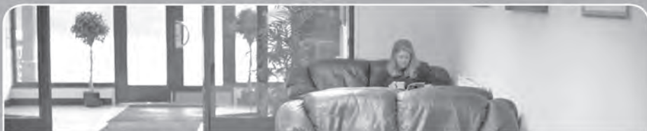
Comfortable waiting area