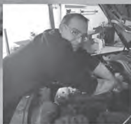
Friendly & experienced staff to look after you